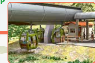
Arrival Platform La Malca Lookout. Beginning of the tour