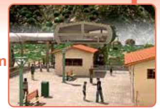
Departure Platform From here, the air route begins in the Cable Cars to Kuélap