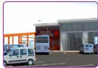
Boarding Station From here you will travel 3 km by bus to the departure platform