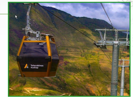
Cable Cars With capacity for 8 people, they will ascend at a speed of approximately 6 meters per second