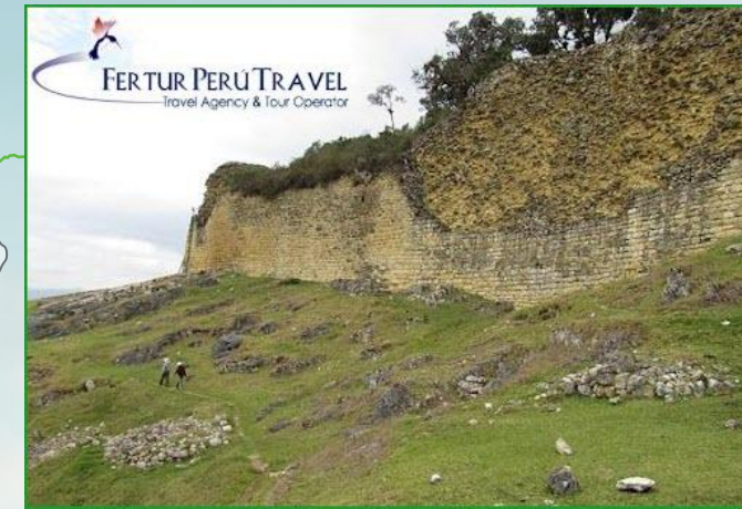
Temple Fortress of Kuélap