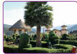
Tingo Nuevo Capital of the district of Tingo, province of Luya, located 40 km from Chachapoyas.